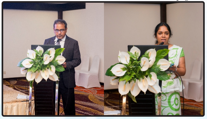
Co-Chairs of the Scientific Committee

The 74<sup>th</sup> Annual Scientific Sessions of the SLVA was held under the theme " Harnessing Veterinarians' contribution to ensure food security and to strengthen the one heath approach " at the Amaya Hills Hotel Kandy, on 21^{st} October 2022. Cont. to page 06