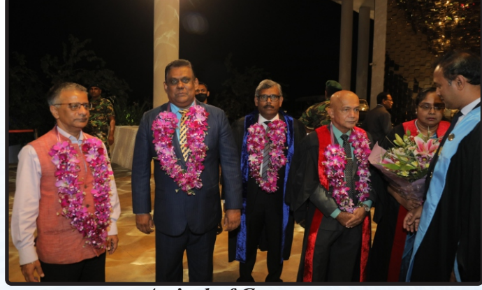
Arrival of Guests