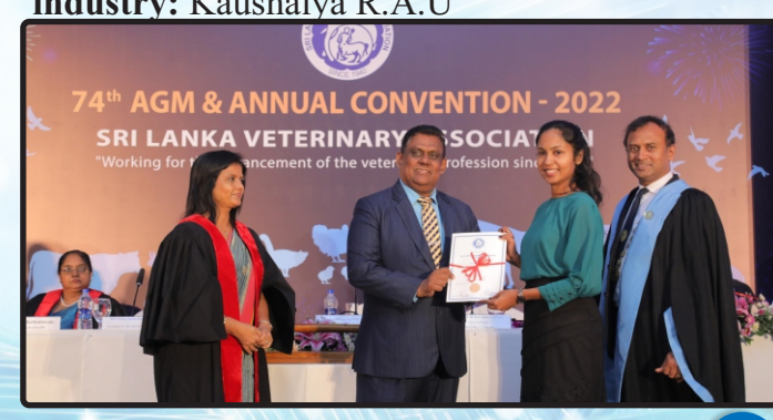
Visit our official website: www.slva.org for updates