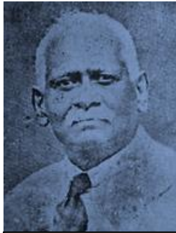
W.A. De Silva