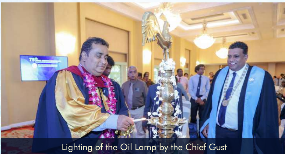
Lighting of the Oil Lamp by the Chief Guest