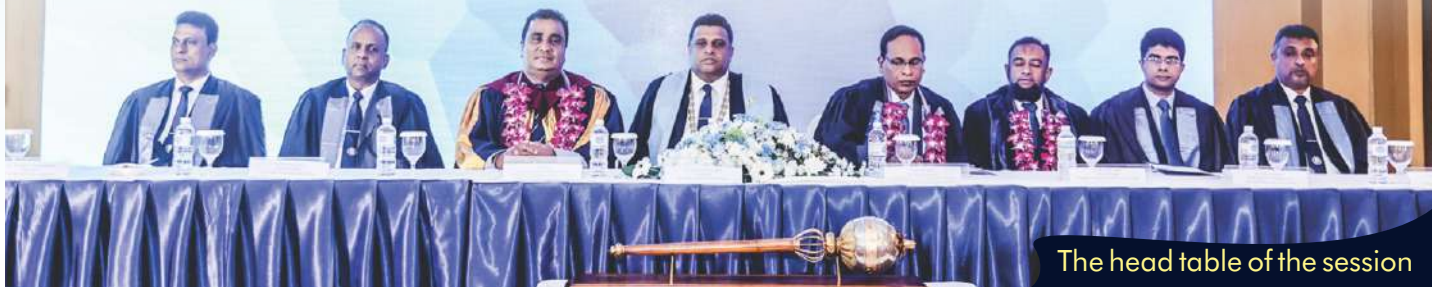
The head table of the session